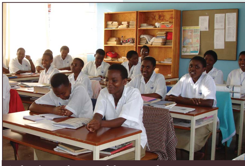
Students in a newly renovated classroom at the Rwamagana Nursing and Midwifery School

"HIV, family planning, maternal and child health and gender content is integrated into the courses."