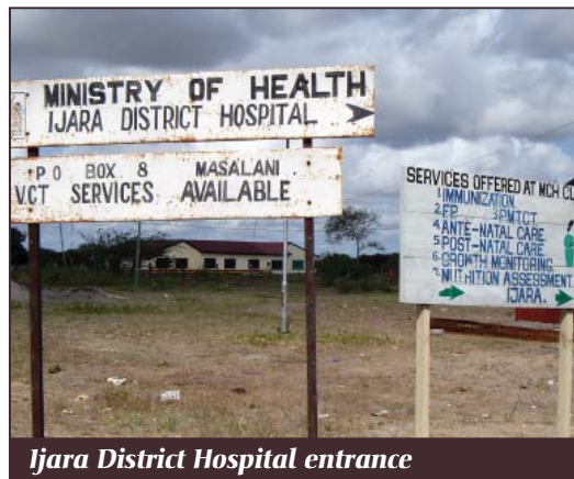
Ijara District Hospital entrance