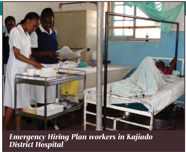
Emergency Hiring Plan workers in Kajiado District Hospital

The Voices from the Capacity Project series is made possible by the support of the American people through USAID. The contents are the responsibility of IntraHealth International and do not necessarily reflect the views of USAID or the United States Government.