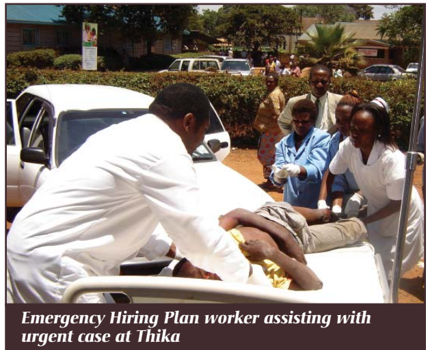
Emergency Hiring Plan worker assisting with urgent case at Thika