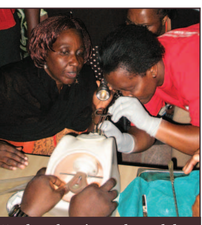
Hands-on learning at the workshop