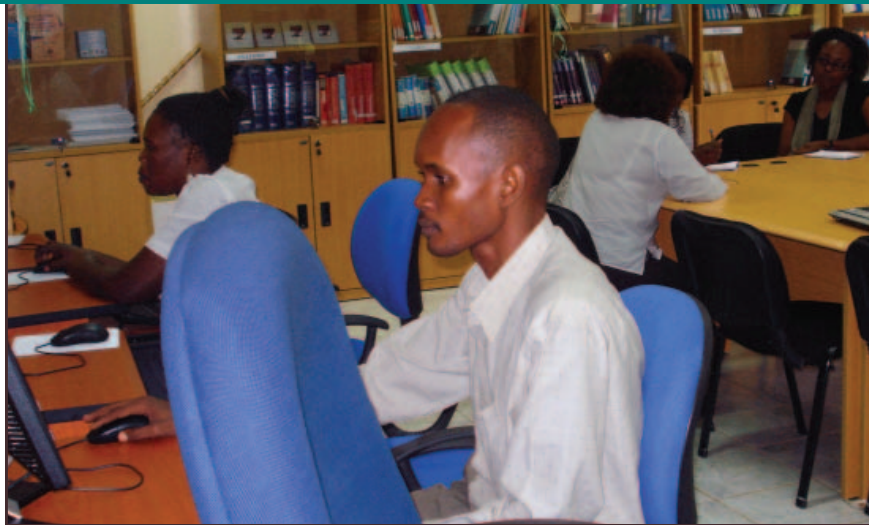
Juba Teaching Hospital Health Information Resource Center