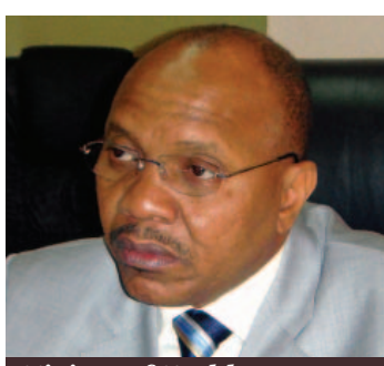
Minister of Health M. Oumar Ibrahim Touré

The Capacity Project, funded by the United States Agency for International Development (USAID) and implemented by IntraHealth International and partners, helps developing countries strengthen human resources for health to better respond to the challenges of implementing and sustaining quality health programs.