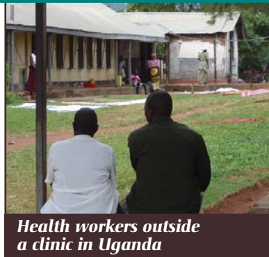
Health workers outside a clinic in Uganda

professionals for 2007/2008," said a team member. "We have also identified the need to support our hospitals and clinics to plan for their HR needs and provide us with the data. We have benefited from VLDP [by using] the team approach and broad-based action to achieve this goal."