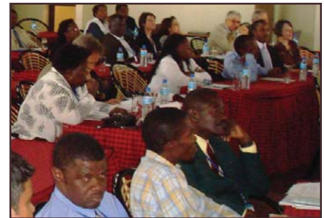
Participants in the Africa Health Workforce Observatory meeting in Tanzania

Importantly, graduates report that they have gained a sense of empowerment about their ability to effect change. Through the VLDP, "I am able to handle people who resist change, and my communications skills have improved," said one participant. "I am more confident now." Another participant added, "The VLDP helped me to understand that I can be a leader."